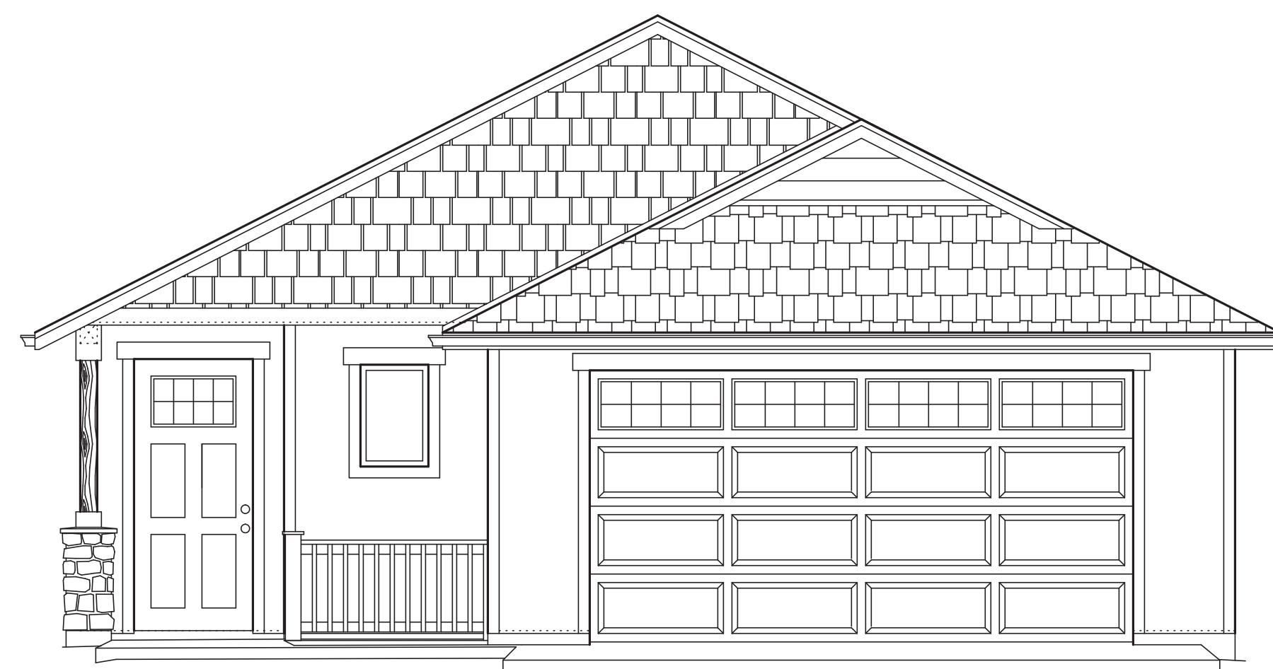
OPTIONAL FRONT ELEVATION