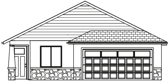
Shown with optional stone veneer and garage door windows