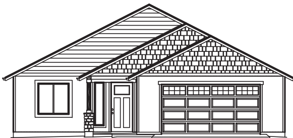
Shown with optional stone column and garage door windows