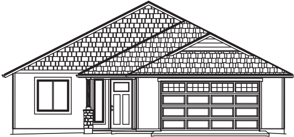
Shown with optional stone column and garage door windows