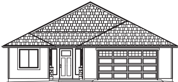
Shown with optional stone veneer and garage door windows