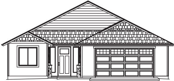
Shown with optional stone veneer and garage door windows