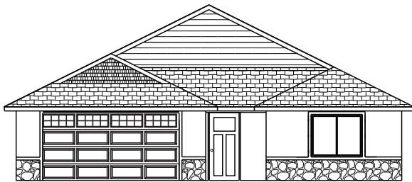
Shown with optional stone veneer and garage door windows