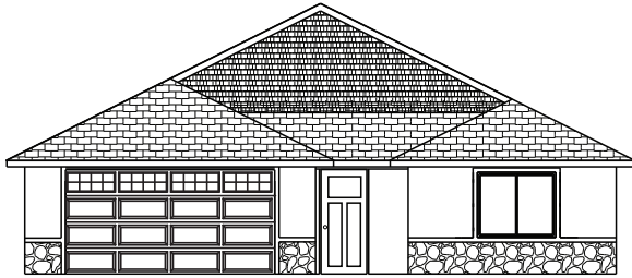
Shown with optional stone veneer and garage door windows